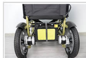
250W*2 Brush Motor