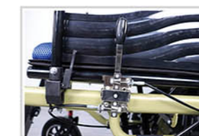
Manual Lying Back Switch (MFW805CT/MFW805DT)