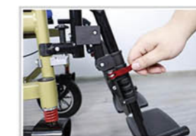
Manual Leg Lifting (MFW805CT)