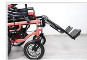
Gas Spring Leg Lifting (MFW805DT)