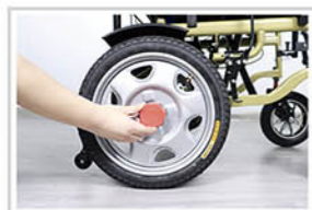
Manual/Electric Mode Switch