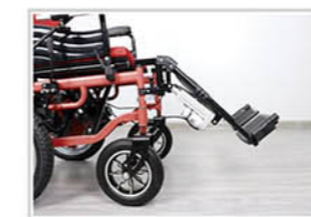
Electric Leg Lifting (MFW805ET)